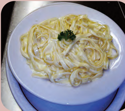
LINGUINI ALFREDO 11.99 With Grilled Chicken 15.99 With Grilled Shrimp 17.99 With Red Salmon 17.99