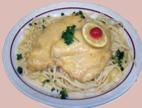
CHICKEN FRANCAISE 14.99 Sauteed In Butter, Wine, Lemon And Egg