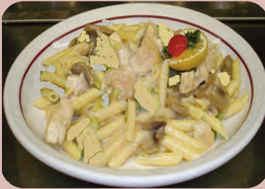
SAUTEED CHICKEN 14.99 Garlic, Onion, Mushroom Sauce Oven Linguini