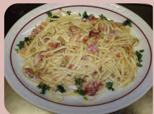
PASTA CARBONARA 14.99

Twin Pines RESTAURANT & DINER Where the Food is Good and the Price is Right