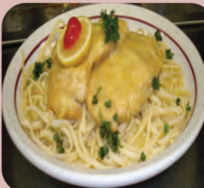
VEAL FRANCAISE 15.99 Sauteed In Butter, Wine, Lemon And Egg