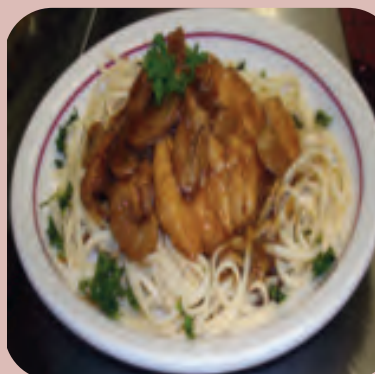
CHICKEN MARSALA 14.49 With Wine Marsala Sauce