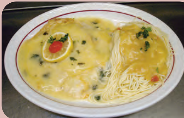
TILAPIA FRANCAISE 14.49 Sauteed In Butter, Wine, Lemon And Egg