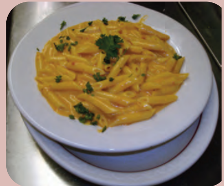
PENNE ALA VODKA 14.99 With basking In a Creamy Pink Vodka Sauce With Grilled Chicken 15.99 With Grilled Shrimp 17.99