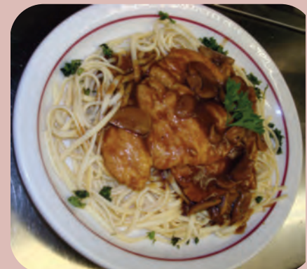
VEAL MARSALA 14.99 With wine Marsala Sauce