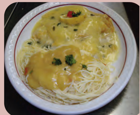
FILET OF SOLE FLORENTINE 13.99