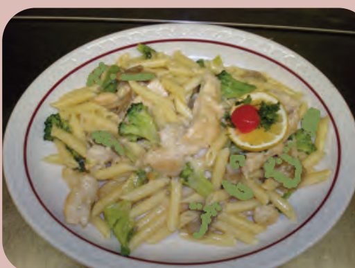
CHICKEN CON BROCCOLI 14.99

Twin Pines RESTAURANT & DINER Where the Food is Good and the Price is Right