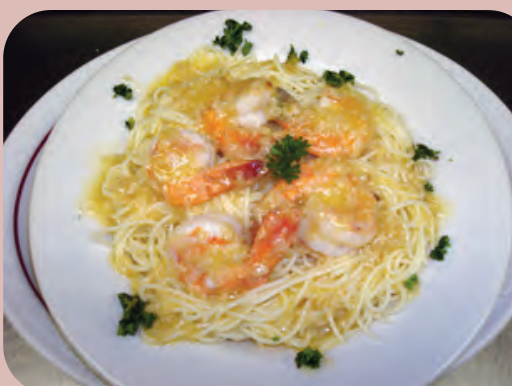
SHRIMP SCAMPI 15.99 Over Linguini